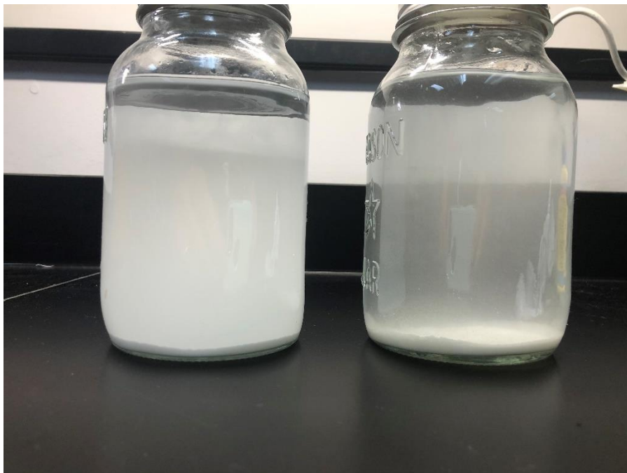
JARS WITH & WITHOUT API ACCU-CLEAR USAGE