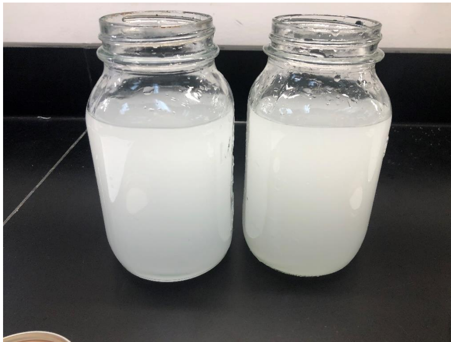
INITIAL SETUP OF CLOUDY WATER