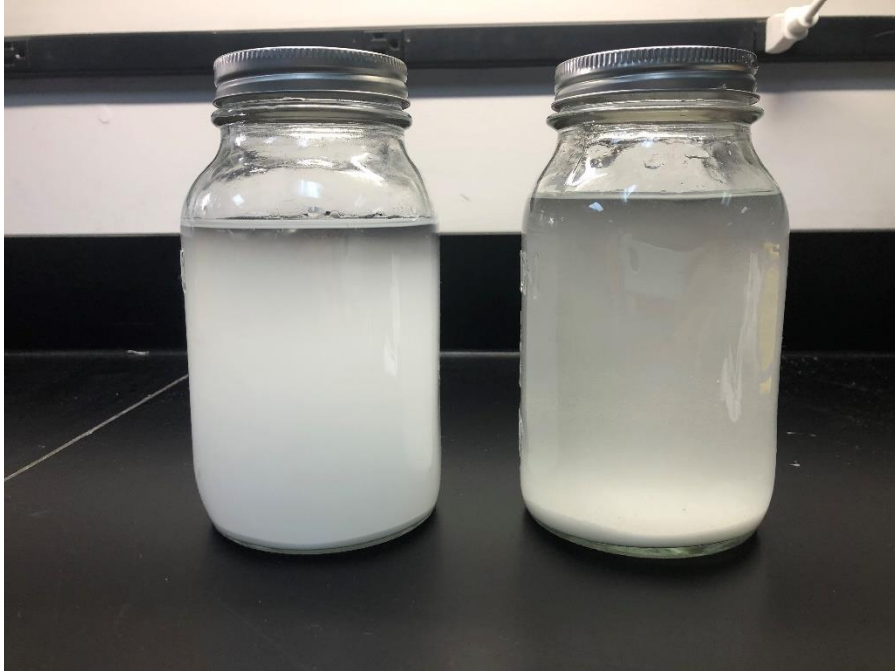
SETUP WITH API ACCU-CLEAR REACTING