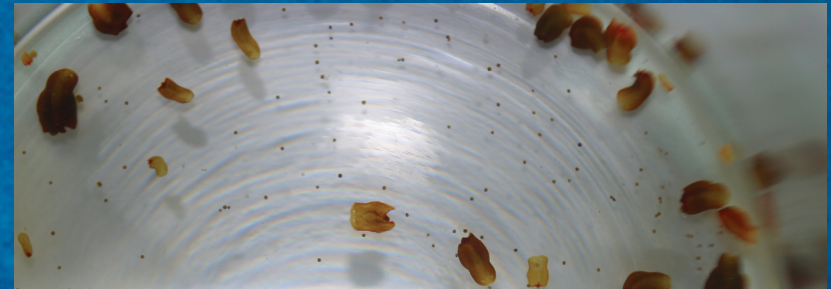
Photograph 1: Untreated flatworms in a beaker containing saltwater.

Marine flatworms are considered nuisance species, and can cause severe damage to corals kept in reef aquariums. The best method of control is to prevent the introduction of flatworms into the aquarium. Live rock and corals should be treated for flatworms before introduction into the aquarium. MELAFIX MARINE, used as a short term dip or bath treatment, will kill parasitic flatworms in live rock and on coral and help prevent flatworm infestation in a reef aquarium.